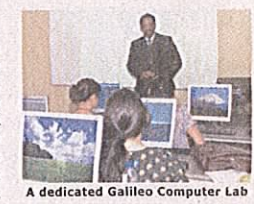
A dedicated Galileo Computer Lab

Kuoni Academy has not just upgraded its classrooms and training facilities. The courses too have undergone a sea change to keep abreast with global trends and requirements. A new initiative is the intensive International Tourism Specialist Course that will be the inaugural course at the new facility. Kuoni Academy has massive expansion plans across India and overseas. By the end of 2009, the Academy aims at having around 30 centres within India and 10 centres overseas.